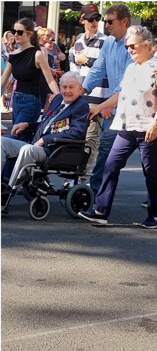
And he walked the last few yards!